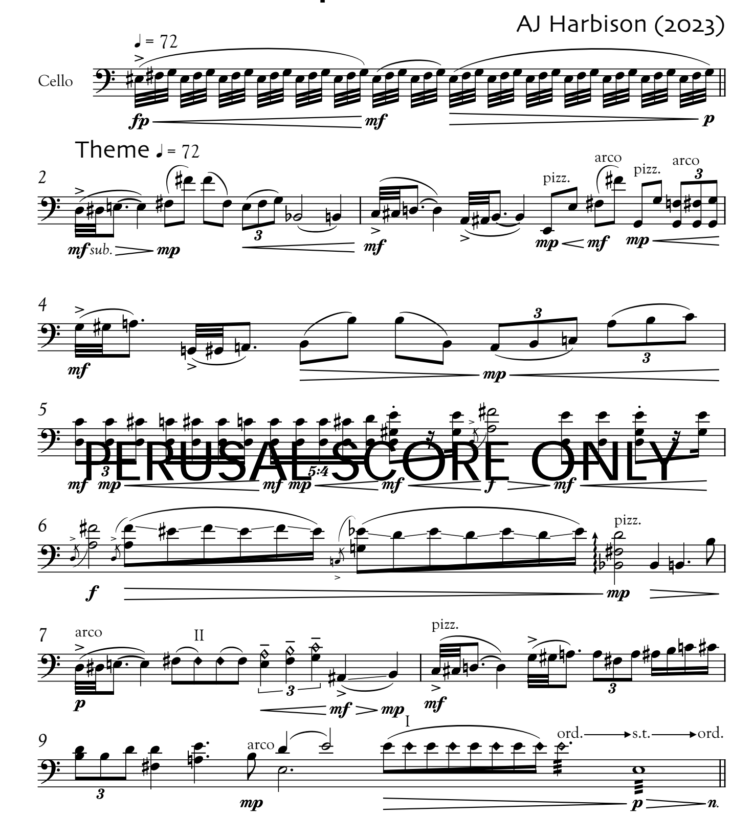
Copyright © 2023 Muse Room Press. All Rights Reserved.